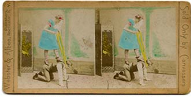
HOLD THAT POSE Erotic Imagery in 19th Century Photography