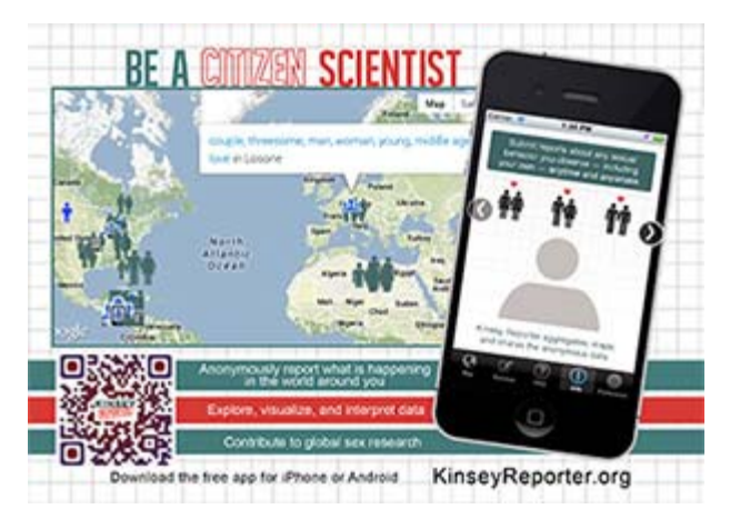
The Kinsey Reporter App is one tool that will aid in collecting information from students on sexual assault.

The Sexual Assault Prevention Research Project will investigate and document the prevalence of sexual misconduct and victimization incidents (including sexual assault, relationship violence, sexual harassment, and