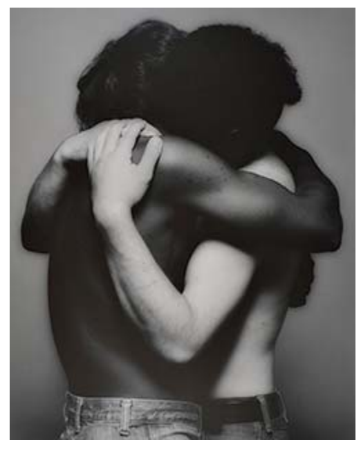
Embrace (1982)

This show presents work by other 20th-century fine art photographers who also focused on the human body.