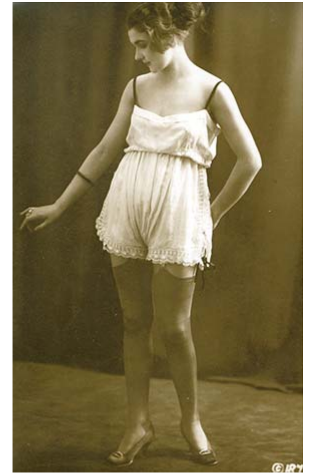
Anonymous photographer, France Woman in undergarment , c.1920 Photograph in postcard format

Both shows open on Friday, September 19, 4:30 to 7:00 pm at The Kinsey Institute Galleries, Morrison Hall, Indiana University.