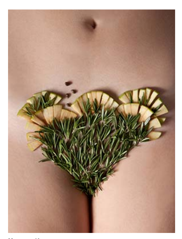
Maureen Kaveney Rosemary & Apples, A Study in Aphrodisiacs, 2012 Color photograph

The Taste of Seduction is offered in conjunction with IU Themester 2014: Eat, Drink, Think.