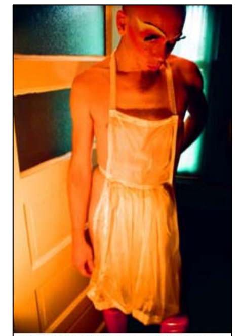
DID YOU MISS the 2010 Juried Art Show? The Opening Night video is now available on our website.

Keep up with The Kinsey Institute™ on Facebook, Twitter, and YouTube